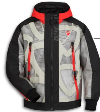
Overlay YO fabric jacket Stylish layer