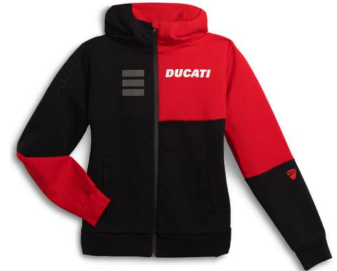
Hoodie sweatshirt - Lady