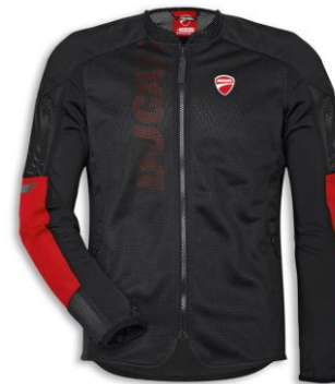
Overlay P01 Protective layer