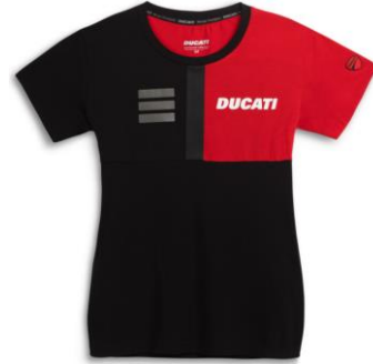
T-shirt - Lady