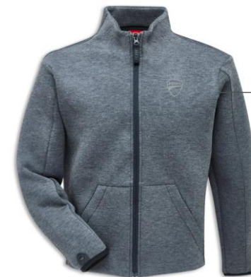
Overlay L01 Thermal layer